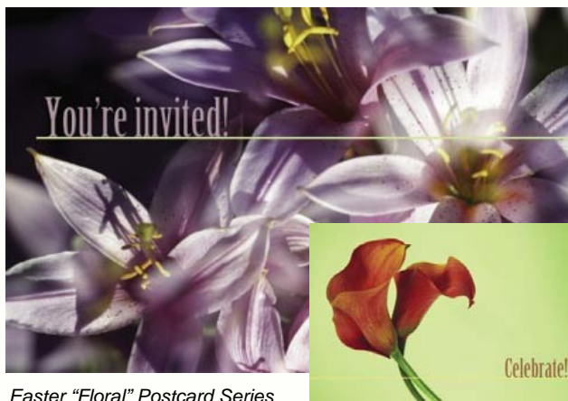
Easter "Floral" Postcard Series

Postcards are available for purchase on Lutheran Hour Ministries' online store which can be found at www.lhmgift.org/storefront or call 1.800.876.9880 to place your order today!