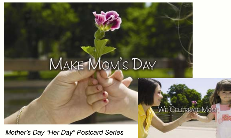
Mother's Day "Her Day" Postcard Series

Surprise your neighbors with seasonal worship invitations designed for you from Lutheran Hour Ministries. Our bold 8 1/2" x 5 1/2" postcards grab attention; your church information helps them make plans. Here are some suggestions for using the cards and following through with guests: