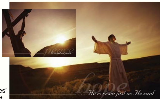
Easter "Biblical" Postcard Series